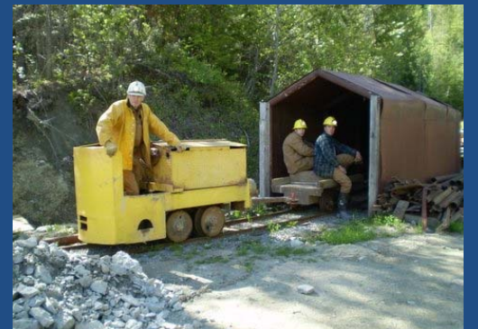
Entrance to Level 257