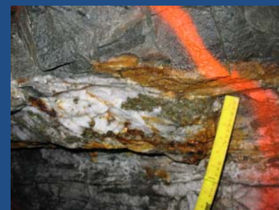
Inside Level 257